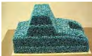
As a 2-stage machining process

CMT Materials, Inc. 107 Frank Mossberg Drive Attleboro, MA 02703 USA T: +1-508-226-3901 F: +1-508-226-3902 Email: info@cmtmaterials.com